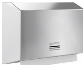
GW03 04 04 02 AISI 304 Bright