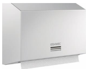
GW03 04 04 01 AISI 304 brushed