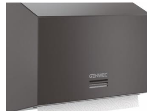
GW03 05 04 03 AISI 304 Matt Black