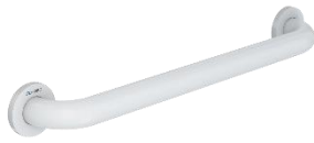
GW11 06 03 00 AISI 201 stainless steel, epoxy white