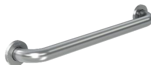
GW11 06 04 01 AISI 304 stainless steel, satin