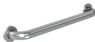
GW11 05 04 01 AISI 304 stainless steel, satin