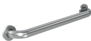
GW11 04 04 01 AISI 304 stainless steel, satin