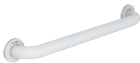
GW11 04 03 00 Galvanized steel, white