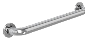
GW11 04 04 02 AISI 304 stainless steel, polished