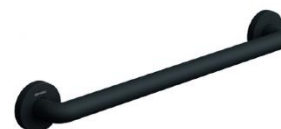
GW11 04 04 03 AISI 304 stainless steel matt black