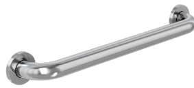
GW11 03 04 02 AISI 304 stainless steel, polished