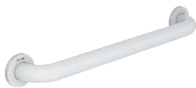
GW11 03 03 00 Galvanized steel, white