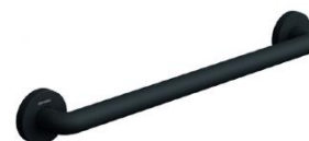
GW11 03 04 03 AISI 304 stainless steel matt black