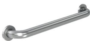
GW11 03 04 01 AISI 304 stainless steel, satin