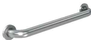
GW11 01 04 01 AISI 304 stainless steel, satin