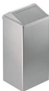
GW06 25 04 01 65L brushed stainless steel