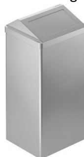
GW06 26 04 01 80L brushed stainless Steel