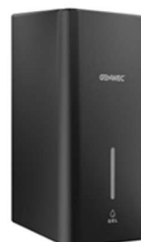
GW04 16 04 03 AISI 304 stainless steel matt black