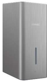
GW04 16 04 01 AISI 304 stainless steel brushed