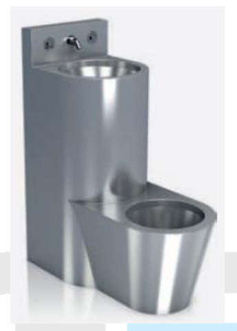
*No representative finish.