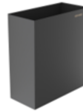
GW06 14 04 03 AISI 304 stainless steel black matt