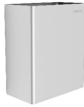
GW06 14 04 01 AISI 304 stainless steel brushed