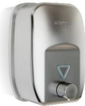
GW04 21 04 01 AISI 304 Brushed