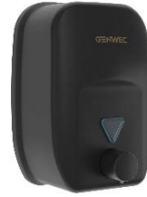
GW04 21 04 03 AISI 304 Black matt