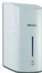
GW04 16 01 00 White