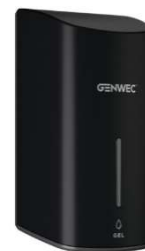
GW04 16 01 03 Black