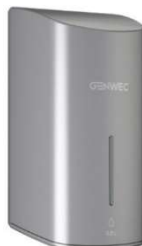
GW04 16 01 04 Silver