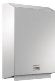
GW03 05 04 01 AISI 304 Brushed