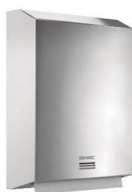
GW03 05 04 02 AISI 304 Bright