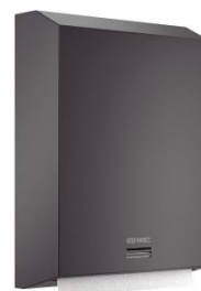
GW03 05 04 03 AISI 304 Matt Black